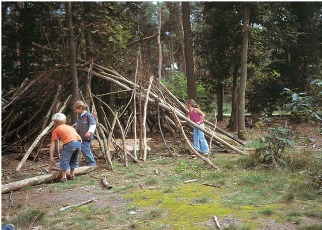
Typical activity organised by the Dutch Staatsbosbeheer

(Comments to Christian.schlatter@bafu.admin.ch )